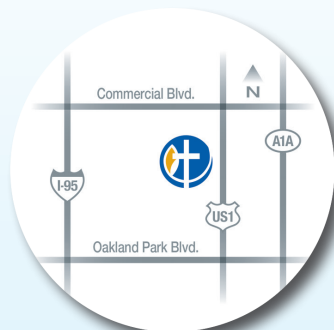
Holy Cross Hospital 4725 North Federal Highway Fort Lauderdale, Florida 33308