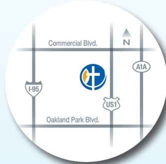
Holy Cross Health 4725 North Federal Highway Fort Lauderdale, Florida 33308