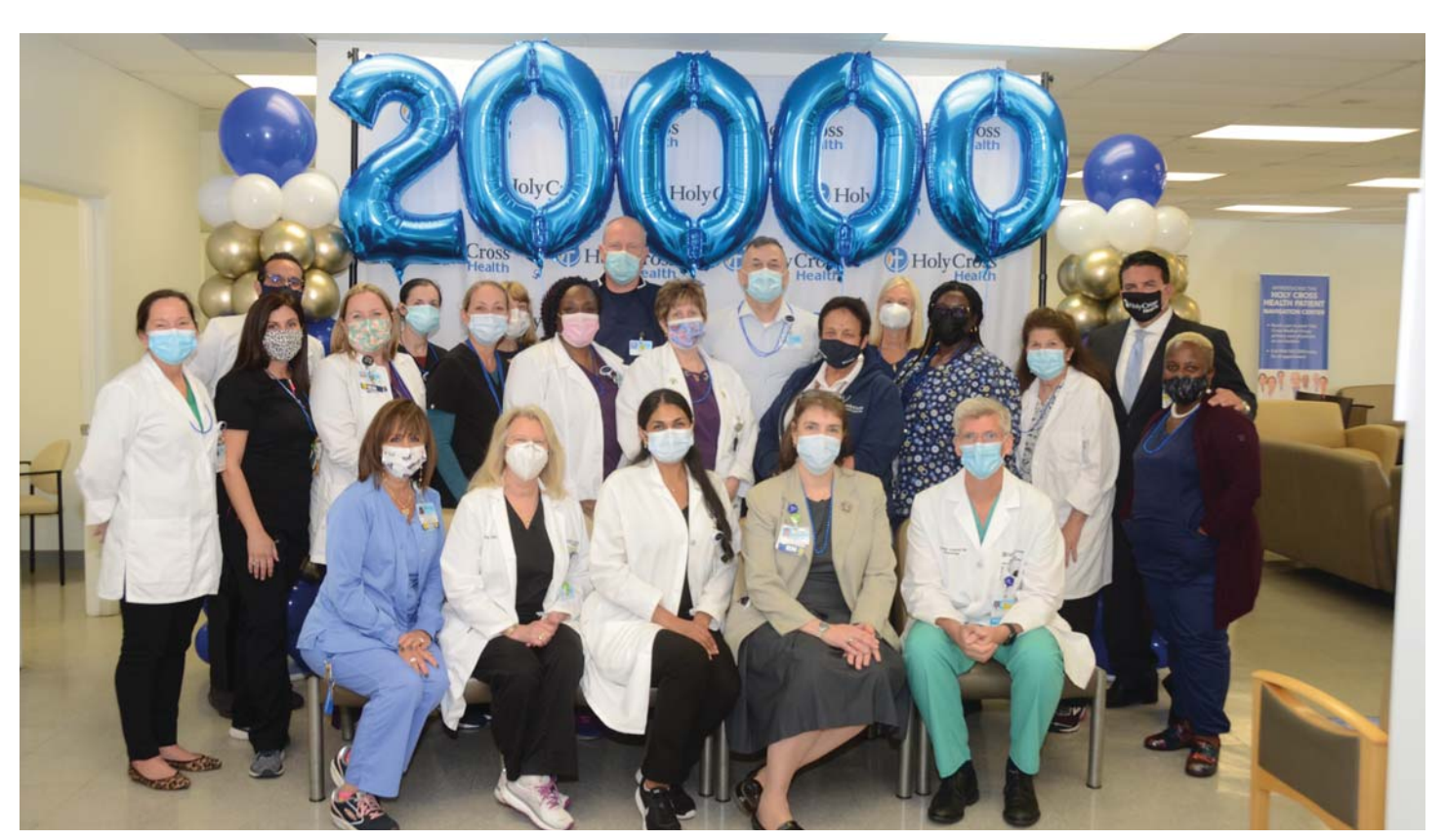
THE 20,000 VACCINE GIVEN AT THE HOLY CROSS VACCINE CENTER. THE ESTABLISHMENT OF THIS CENTER WAS FUNDED BY PHILANTHROPY.